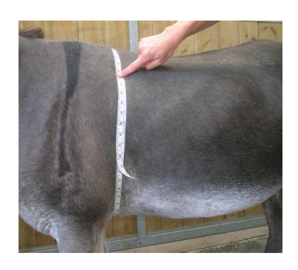
Heart Girth (cm)

The heart girth measurement should always be taken in the same location preferably by the same person to ensure a continuity of the measurements taken. Both height and heart girth measurements can then be marked on the weight estimation chart and the donkey's weight read off the centre scale by drawing a line between the two measurements.